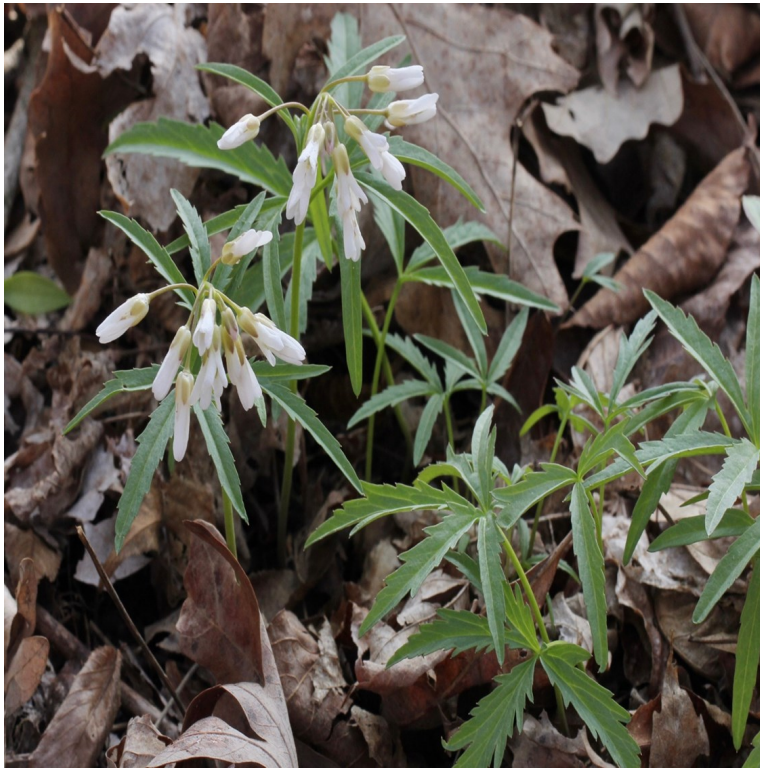
Tucked in with the other ephemerals are several blooms. With very deeply lobed, serrated leaves is Cut-leaved Toothwort ( Cardamine concatenata )

The lacy cut leaves of Dutchman's Breeches ( Dicentra cucullaria ) look even more fragile than the multiple 'bloomer like' blooms hanging from the flower stalk. It is easily distinguished from its close relative Squirrel-corn ( Dicentra canadensis ) because the spurs are more pointed and spread apart than in Squirrel -corn.