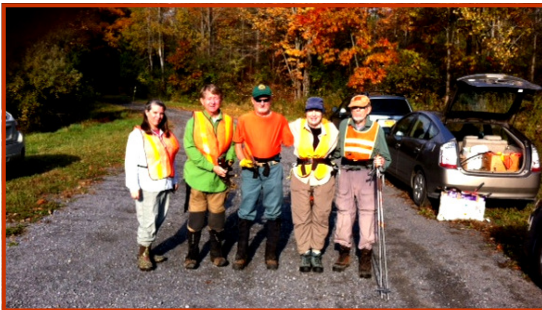
Featherstonhaugh Ski Trail Clearing Volunteers

ECOS: The Environmental Clearinghouse, Inc. P.O. Box 9118, Niskayuna, NY 12309 (518) 370-4125