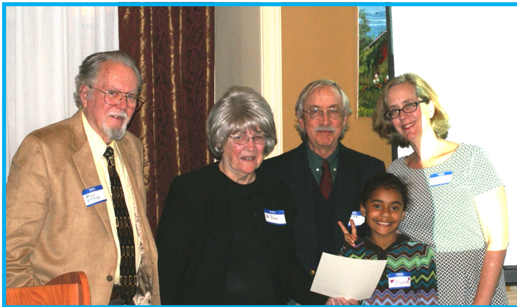
Rachel Carson Award Presentation

We hope this walk helps support the establishment of a greenway through the heart of Amsterdam, along the North Chuctanunda Creek from the Pedestrian Bridge across the Mohawk River to Shuttleworth Park.